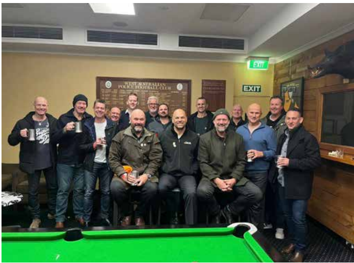
2023 WAPFC aka WA Hogs Life Members evening held at Barrellhouse Perth aka Hogs HQ.