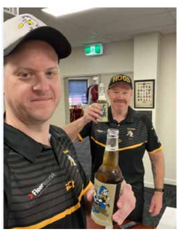
Some WA Hogs executive 'de stressing' at the home NPFC