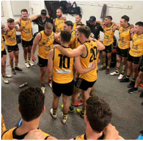
WA Hogs debutants celebrate a win.