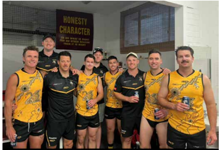
'Yangebup Bank – Honesty, Character, Accountability'.