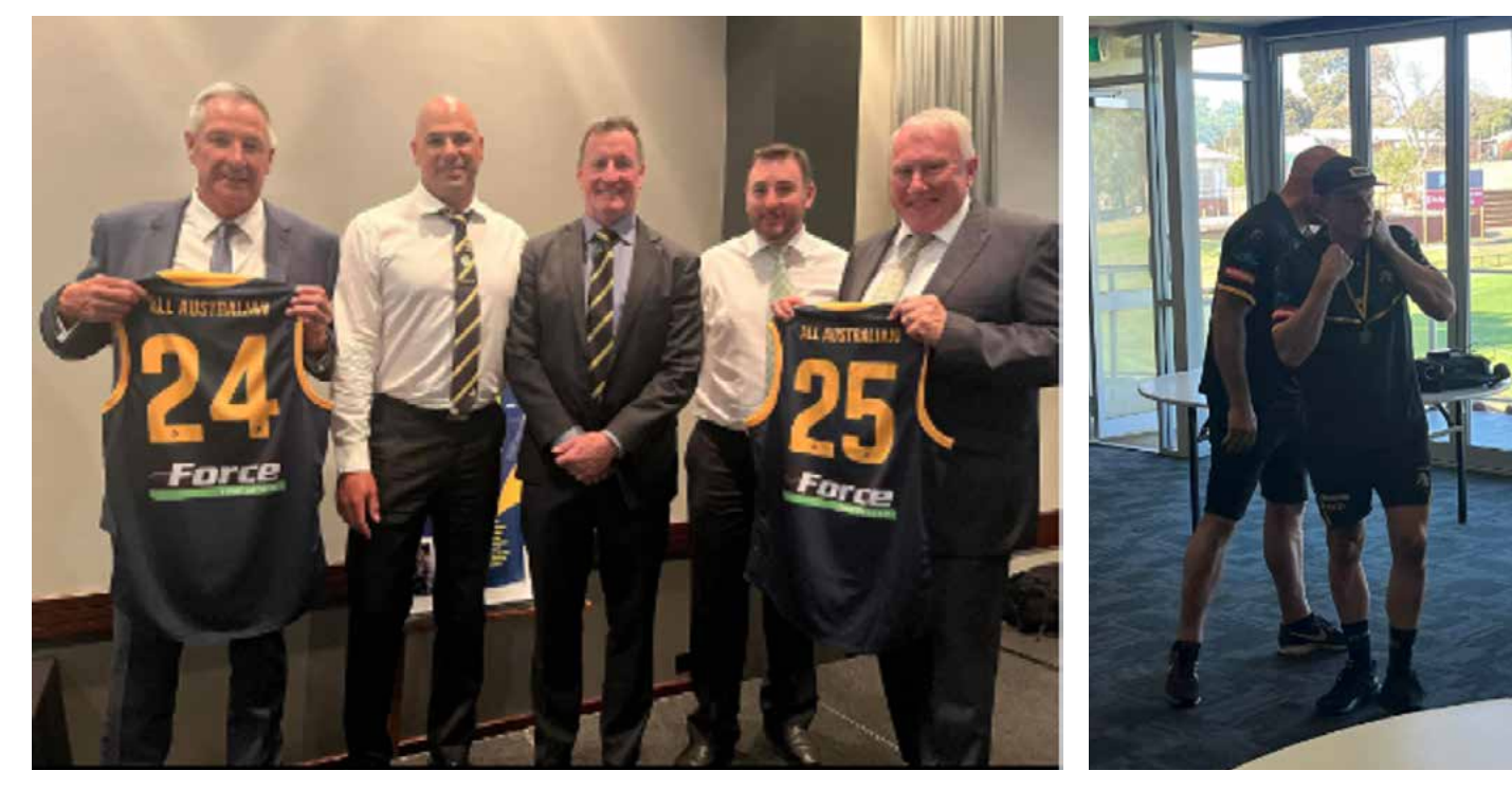
Proud and Ioyal WA Hogs sponsors Force Real Estate