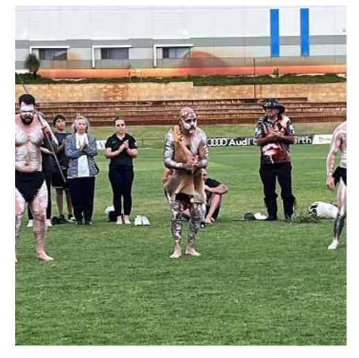
2023 NPFC opening ceremony – Welcome to Country